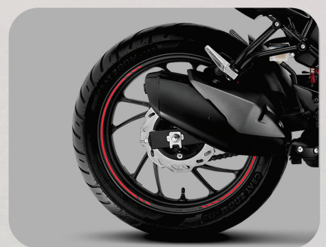
FRONT & REAR PETAL DISC BRAKES

*Fastest compared to all oil & air cooled engine motorcycles in the 160cc segment as per internal testing.