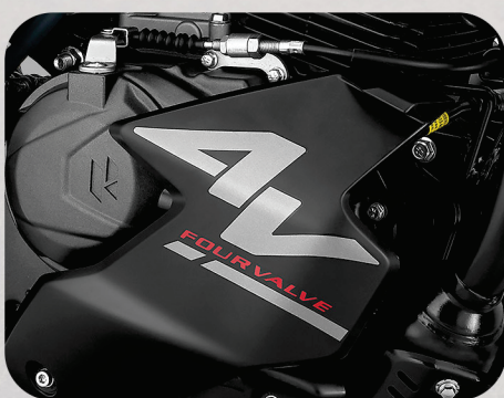
4V ENGINE WITH 5-FIN OIL COOLER