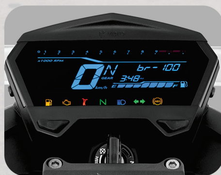
LCD DISPLAY WITH ADJUSTABLE BRIGHTNESS