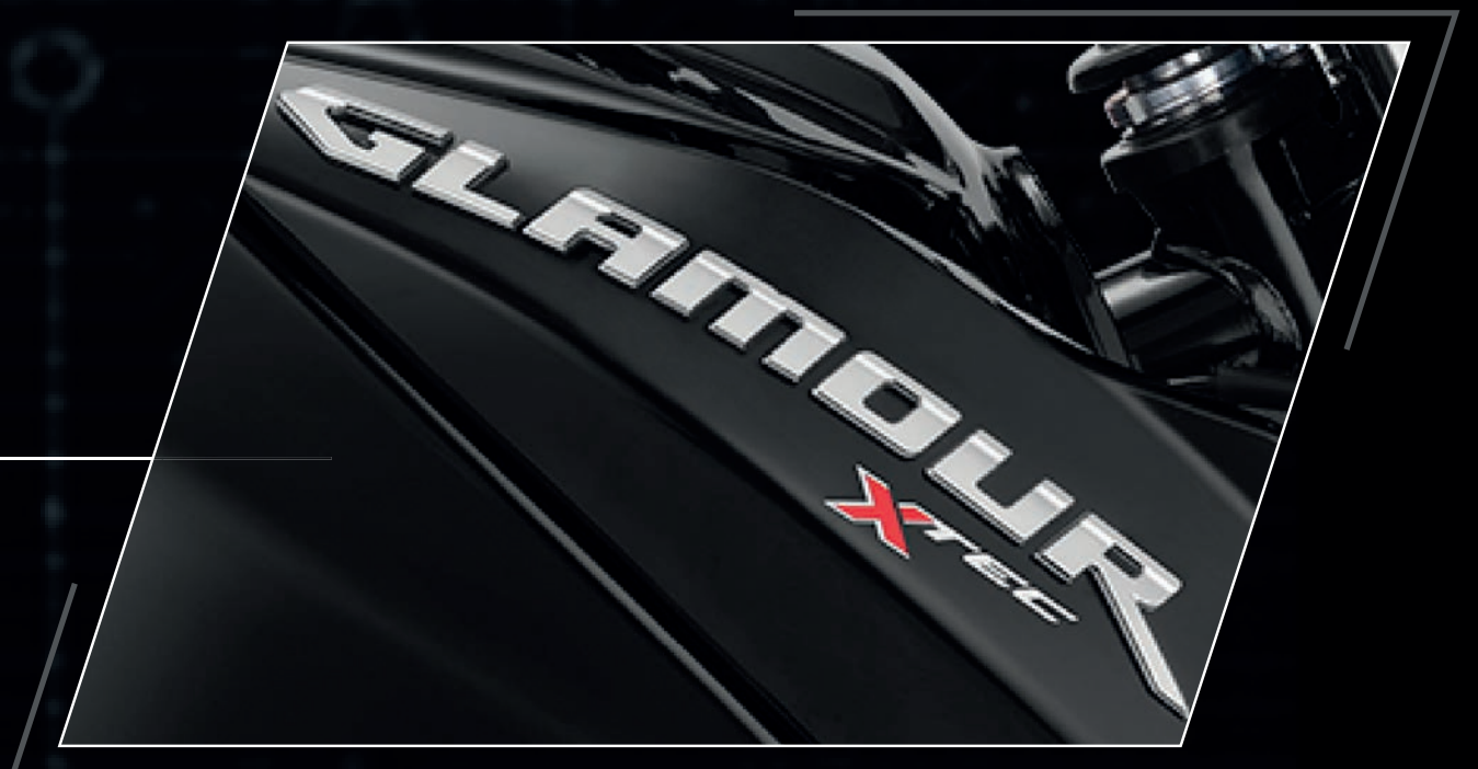
3D GLAMOUR BADGING