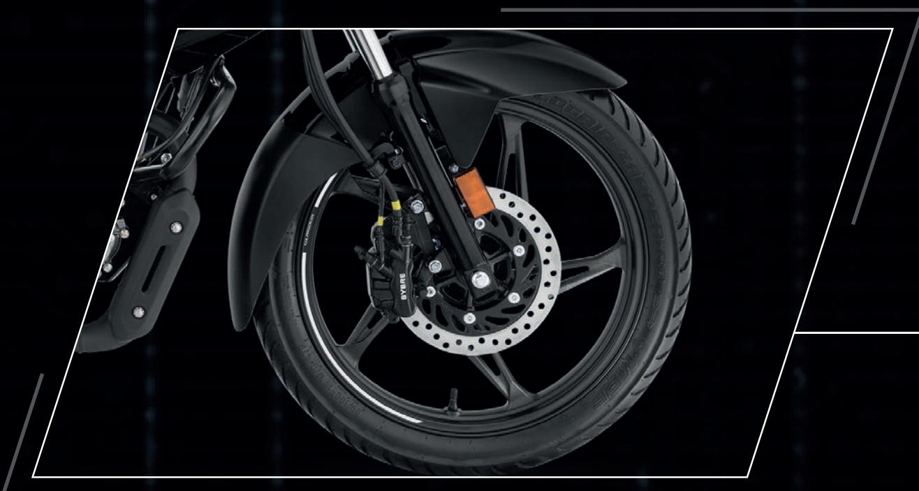
SPLIT ALLOY WHEELS