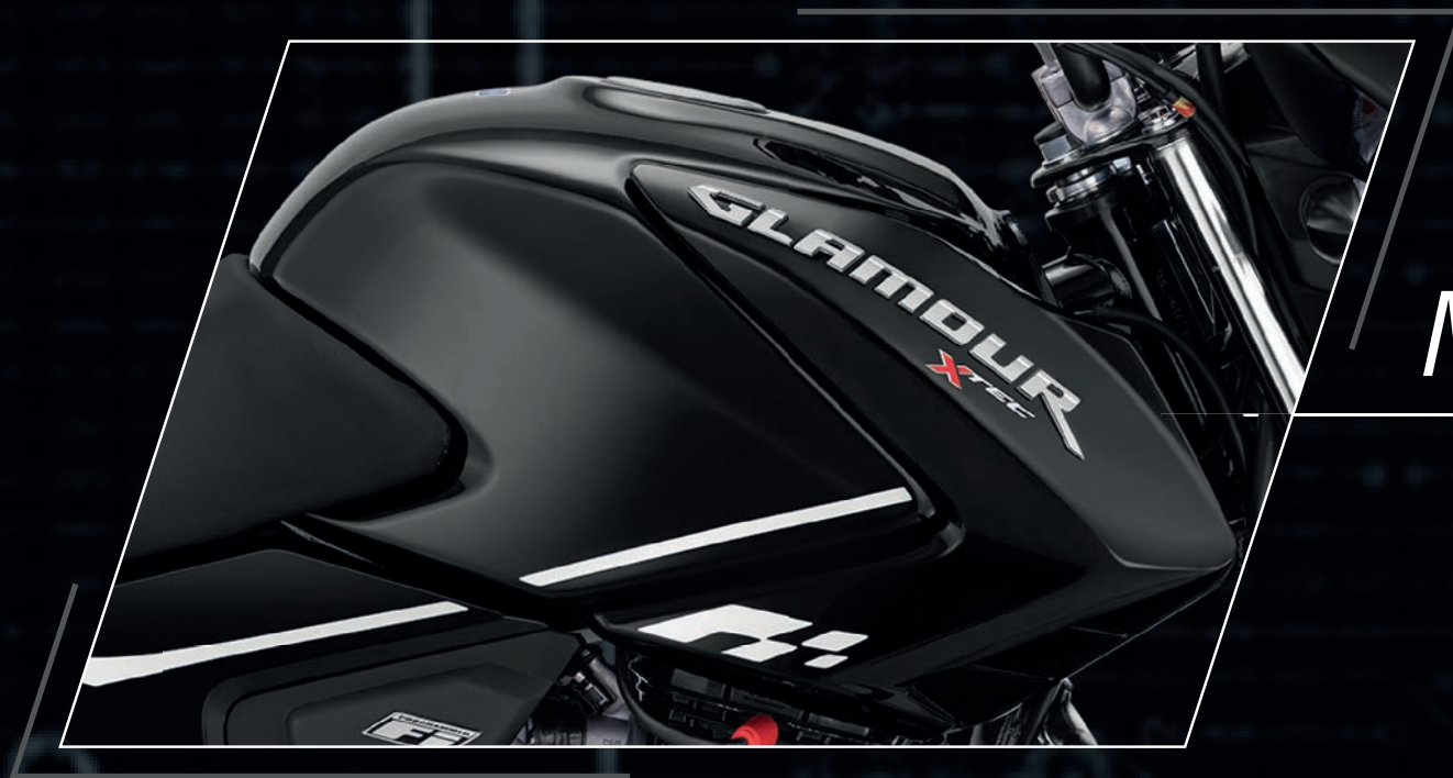
MUSCULAR FUEL TANK